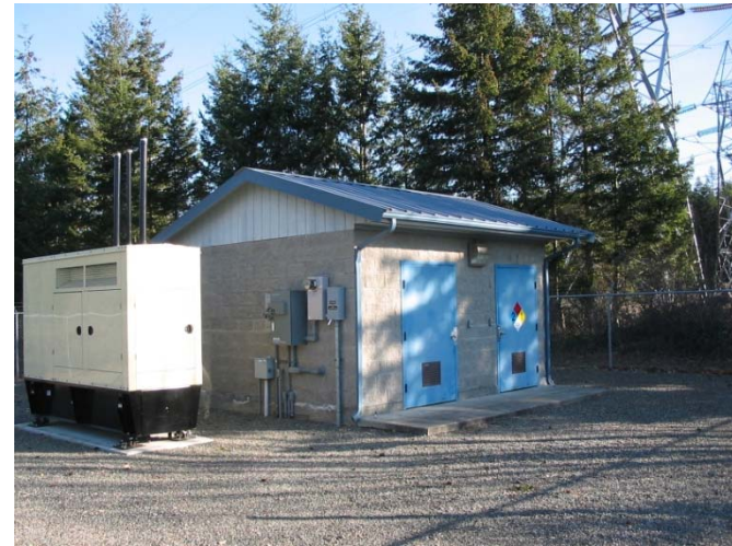
Sugarloaf Well #3 Treatment Facility